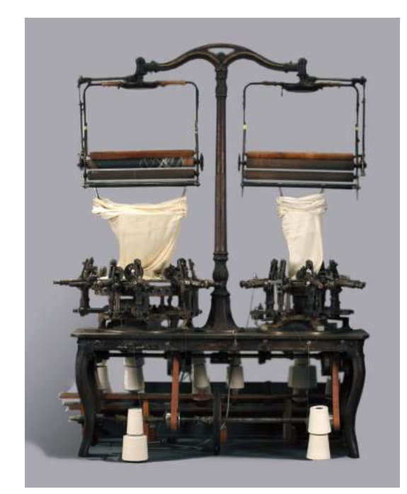
Object: Upright Rotary Knitting Machine Tompkins Brothers, Troy, New York, c. 1895, cast iron, metals, cotton yarn, wood, courtesy of the New York State Museum