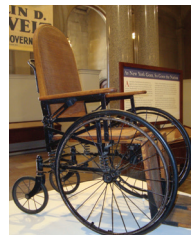
State of New York

Take a tour of "CHAIRy" Hill, and view the lives of five generations of the Van Rensselaer household (1787-1963) through a wild assortment of chairs representing a motley array of people, stories, designs and functions (regular tour schedule). ♦ Special Murder at Cherry Hill tours investigate the scene of an 1827 crime and the perspectives of those present on that fateful evening. (Fri., 10/28 and Sat., 10/29 at 4, 5:30 & 7 pm).