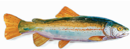
Rainbow Trout , Don Nice, anodized aluminum, 2004

Admission by application; limited to 15 teachers each day: