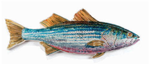
Striped Bass , Don Nice, anodized aluminum, 2004

For a copy of the application visit www.albanyinstitute.org and click on education, or contact