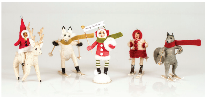
Vintage by Crystal handmade vintage inspired figures and ornaments for holidays, special occasions, and everyday enjoyment.