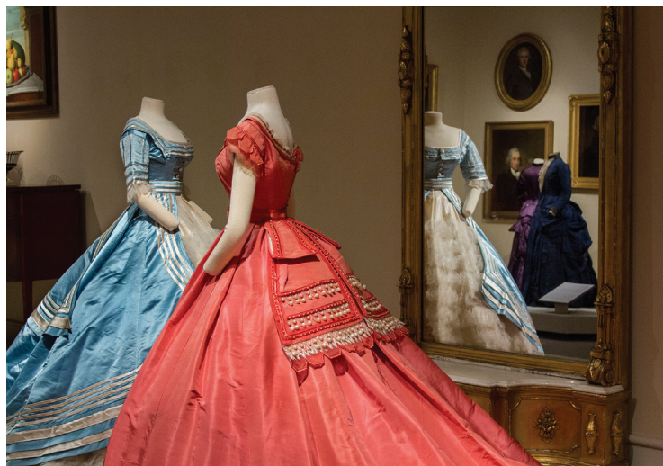
Well-Dressed in Victorian Albany: 19th Century Fashion from the Albany Institute Collection (October 7, 2017–May 20, 2018) drew visitors from across the country and introduced the museum's remarkable clothing collection to the world.

Are you interested in supporting the Albany Institute of History & Art? Consider making a contribution now.