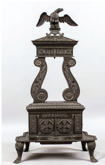
Two-column Parlor Stove, Low and Leake, Albany, New York, 1844-1846, cast iron, Albany Institute of History & Art Purchase, 1969.41

During the nineteenth century, Albany and Troy, New York, manufacturers were considered to be among the largest producers of cast-iron stoves in the world. Stoves made in these cities were renowned for their fine-quality castings and innovations in technology and design. The strategic location of Albany and Troy, located nine miles apart on opposite banks of the Hudson River, afforded easy and inexpensive transportation of raw materials to the foundries, and finished stoves to worldwide markets.