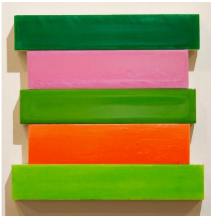
Victoria Palermo, Stacked Greens Acrylic resin and pigment on boards - Submitted 2019