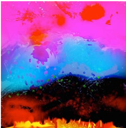
Willie Marlow, Lava Flow Archival Pigment Print - Submitted 2018

The Albany Institute considers art in any medium for entry. However, due to the limitations of the venue and the nature of the event, video and performance art cannot be accommodated. Please consider that, while there is no minimum or maximum size for submitted art, extremely large works may be difficult to accommodate and run a greater risk of not being accepted. All works should be suitably framed and ready to hang if necessary. The museum will provide pedestals for three dimensional works.