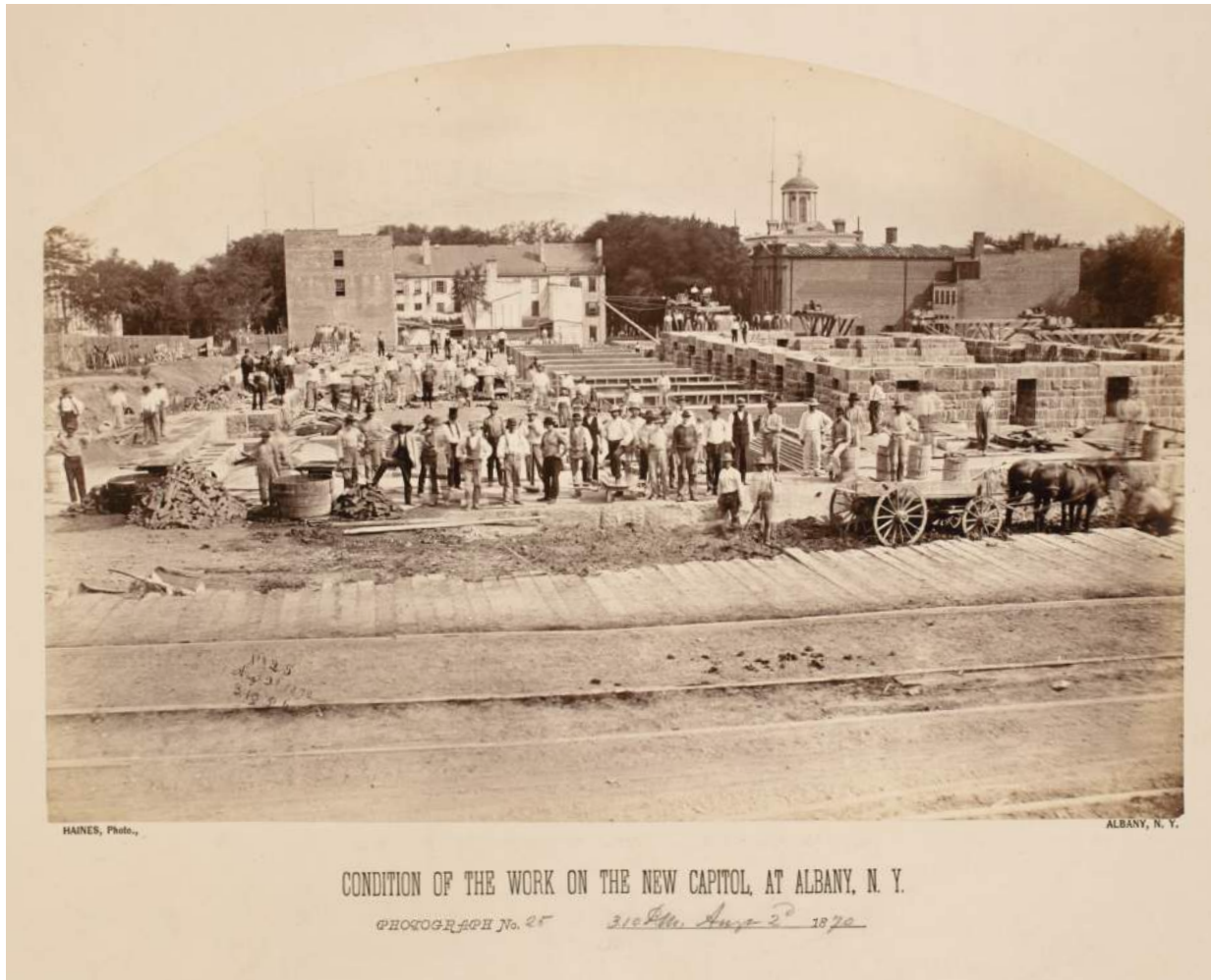
CONDITION OF THE WORK ON THE NEW CAPITOL, AT ALBANY, N. Y. PHOTOGRAPH No. 25 310 1/2 in. Aug 2 d 1870