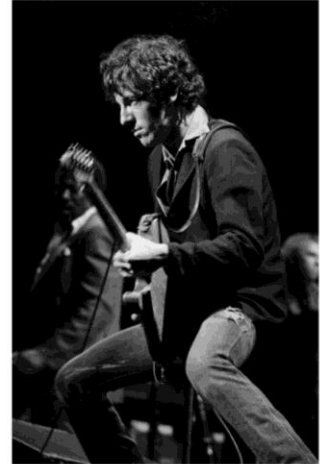
Bruce Springsteen by Patrick Harbron, Darkness on the Edge of Town tour, November 16, 1978, Maple Leaf Gardens, Toronto