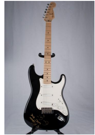
Autographed Fender Custom Shop Stratocaster “Eric Clapton Signature Model,” 1988, Collection of The Rock and Roll Hall of Fame and Museum, Cleveland, Ohio