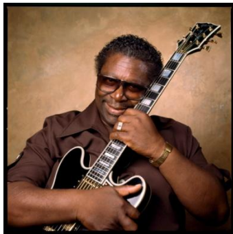
B.B. King, Les Paul and Friends HBO Concert, August 1988, Brooklyn Academy of Music