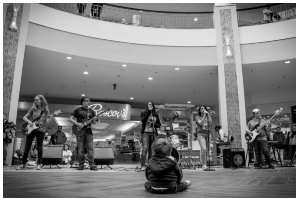
School of Rock performance

The Albany Institute of History & Art is located at 125 Washington Avenue in Albany, New York. Free parking is available in the museum's lot at the corner of Elk and Dove Streets.